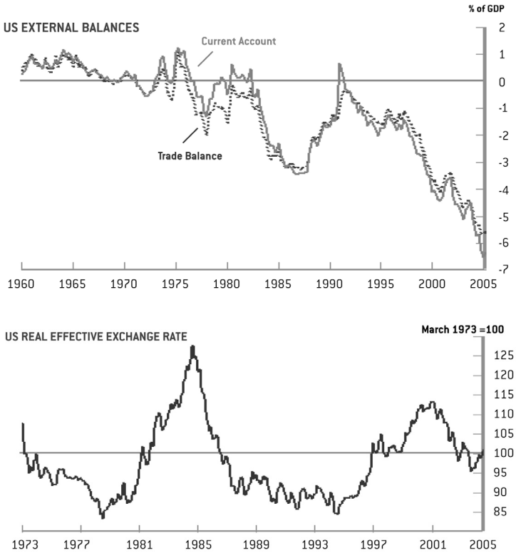
FIGURE 3 U.S. External Balances and Real Effective Exchange Rate

Source: Alan Ahearne and Jürgen von Hagen, 2005. Global Current Account Imbalances: How to Manage the Risk for Europe . Bruegel policy brief 2005/2 (December).